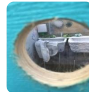
Street art by homeless young men on living on the street (Manchester)