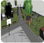
Young people's idea of regenerating urban wasteland (Plovdiv)

Accompanying youth-led projects provided insight into the mutual interplay between processes of participation and learning. These projects challenged assumptions about where, when and how young people participate and what it means to them. They seek to make a contribution in contexts that are often experienced as constricted, limiting and uncertain. A key finding is the significance of participation as a situated social learning process connected to the search for identity, belonging and status as citizens. Below there are three examples, further projects are documented in a video ( www.partispace.eu ).