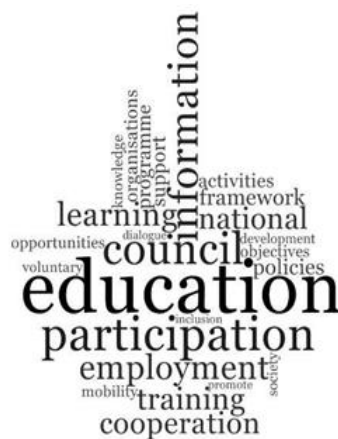
Figure 1: Word cloud of the terms most used in European documents

A first key finding is that in all documents a concept of participation 'in something' is predefined and institutionalised by adults prevails.