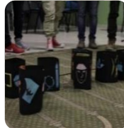
Performance on religious and cultural identities of young muslims (Bologna)